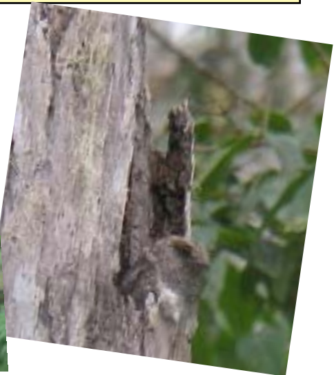
Male Brown Sicklebill, Barred Owlet Nightjar